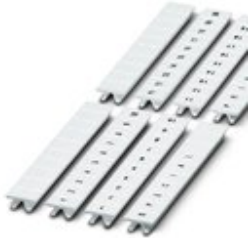
Zack marker strip, 10-section, horizontally labeled with the consecutive numbers: 51 ... 60, white, width: 5 mm

Please be informed that the data shown in this PDF Document is generated from our Online Catalog. Please find the complete data in the user's documentation. Our General Terms of Use for Downloads are valid ( http://phoenixcontact.com/download )